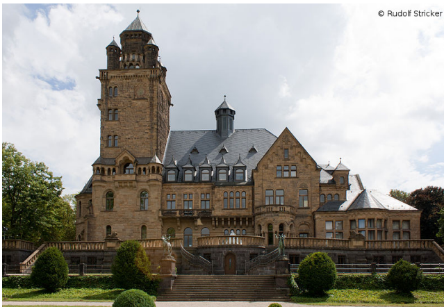
Northern terrace of Schloss Waldthausen