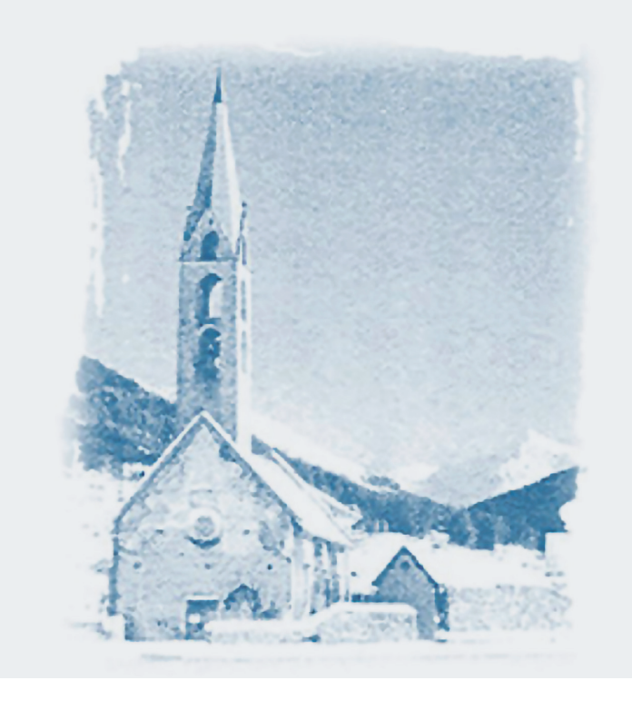
61st International Winter Meeting on Nuclear Physics