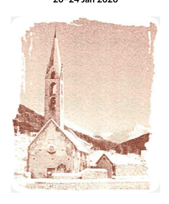
Session Program 20-24 Jan 2020